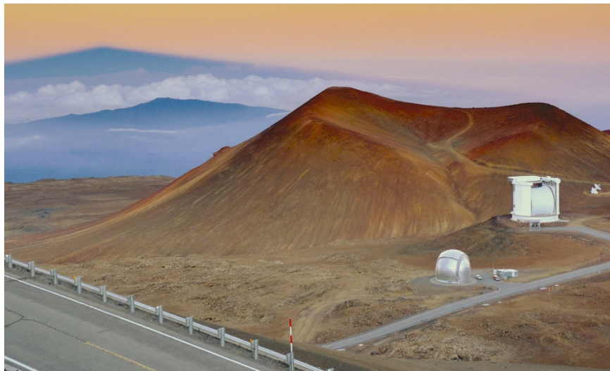
Ki'i 2: Mākaukau 'o JCMT i ke kakahiaka no ke kilo 'ana me ko Maunakea aka e 'ō'ili pi'i ana i hope a luna a'e o Hualalai.